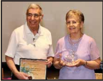
2015 Ambassador Award (see page 4)

Caring for Our Community, One Neighbor at a Time