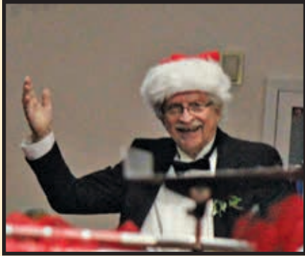
Chandler Symphony and Neighbors Who Care Winter Concert December 7, 2014.

Caring for Our Community, One Neighbor at a Time